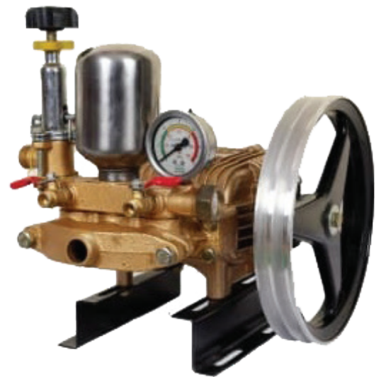
MODEL : SHRACHI SR-HTP-30