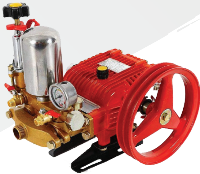
MODEL : SHRACHI SR-HTP-22