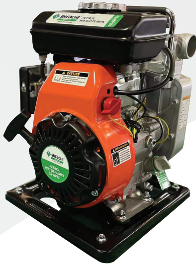
MODEL: SHRACHI WP-15