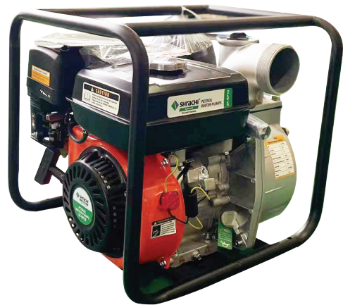
MODEL: SHRACHI WP-30